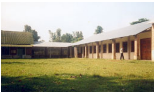
Library Aequatoria - Bamanya

The collection of the Centre Aequatoria library is incomplete. It is no miracle that important books are missing, considering the annual budget for books and magazines is around 1000 euros. Furthermore considering other obstacles - no mailmen in Congo, only 3 hours of electricity a day at the mission, and no modern means of communication - it is a miracle that the library still exists and is maintained.