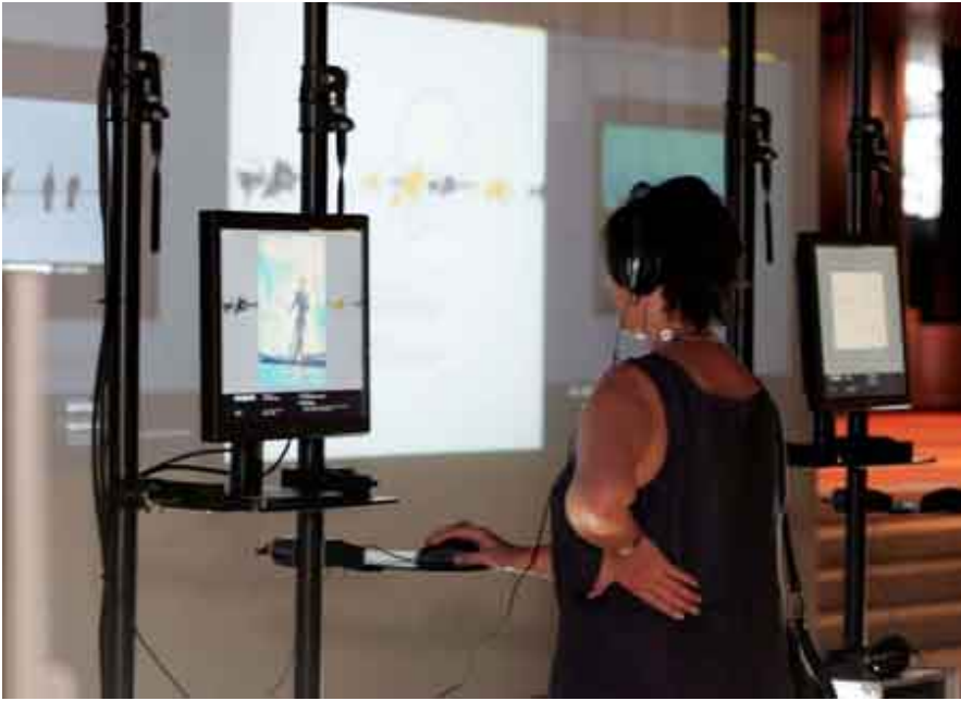
figure# Track04, Bilgi University VCD Department's student exhibiton

Few universities' VCD programs continue to have interesting outcomes. Bilgi University's VCD department supported an annual student exhibition referred to as Track, marginally influential in the initial years. Track was discontinued in 2010.