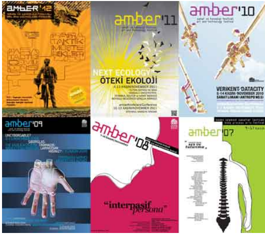
figure# amberFestival posters

After this brief history of new media in Turkey, I will continue with our own experience, BIS and amberPlatform.