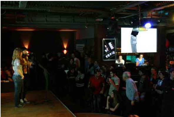
figure# amber'10 exhibition

The first international amberConference was held in conjunction with the 2009 amber Art and Technology Festival. amberConference aims at creating a platform of discussion and dissemination of various themes and topics in which science, art and technology converge. Now in its fifth year, amberConference continues in close collaboration with İstanbul Modern, İstanbul Technical University, Sabancı University and the University of Southampton.