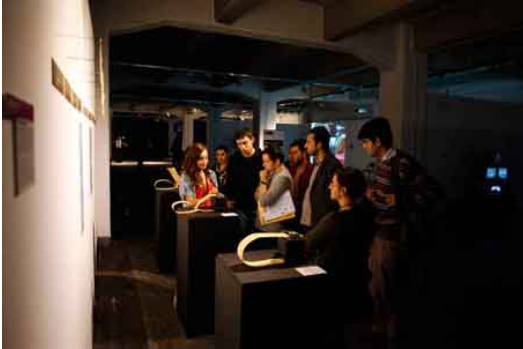
figure# amber'10 exhibition

amberFestival has worked on realizing these objectives in the past years and has created a new international scene on the crossroads of art and technology. The themes of the past 6 festivals were "Voice and Survival" , "Interpassive Persona" , "Uncyborgable?" , "Datacity" , "Next Ecology" , "Paratactic Commons" ; each with references to local as well as international panoramas. This year we focused on smartness, the market-speak of today's technologically sophisticated conditions, with a critical approach. Festival theme entitled "Did you plug it in?" with a subtitle "fool your smartness" .