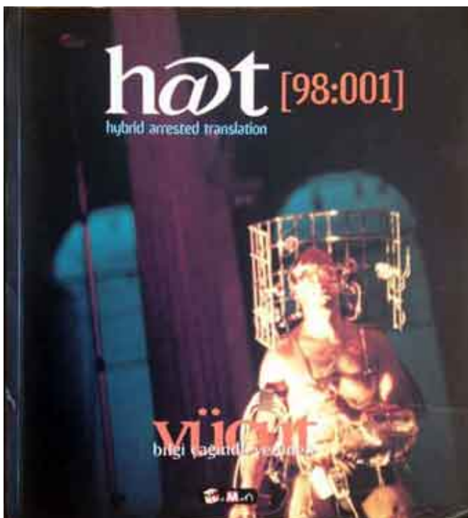
figure# HAT, the first magazine focused on art and new technologies

Istanbul Technical University, the oldest and one of the most respected technical schools of Turkey, started a masters degree program entitled Information Technologies in Design in 2005. The program could have been very successful considering the experience gained in the field at that time and the initiators' new perspective on it. Unfortunately it was not able to survive because of bureaucratic complications.