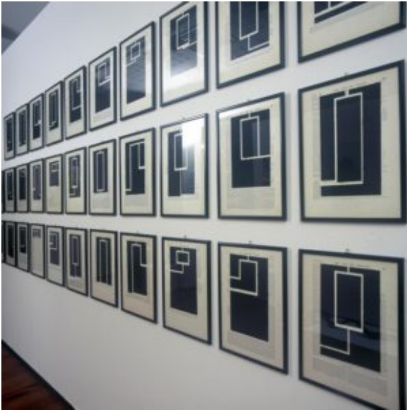
An Introduction to the Principle of Relative Expression, 1979, black oil crayon on pages from the Babylonian Talmud, 27X40 cm each Courtesy of Joseph Sassoon Semah

"To begin with, GaLUT is neither Exile, nor Diaspora, nor an existing Place; GaLUT is simply a disciplined activity, an intensive vision, and it is what GaLUT proceeds to do - to transform each and every temporary MaKOM of shelter, into a perpetual search for a Handful of Soil. At this point, one can say that the depiction of MaKOM in GaLUT is an idea of a constant doubling; A double mirror-image of itself by itself. But behind all these, there is another reality, that is of an absolute Reading, to be defined in terms of the enduring action of Writing." (Joseph Sassoon Semah, 1986)[x]