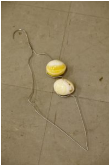
Joseph Sassoon Semah, My Beloved Country - That Did Not Love Me, metal clothes hanger and egg-shaped marble, 33 cm, 1977

Israel on top of a Persian rug. The virulent contrast created by the coupling of these two elements emphasizes an act of deletion where there should have been geographical continuity. The installation points to a place of conflict and unresolved dissonance between the Middle-eastern space, represented here by the brightly embroidered rug, and Israel, represented as a uniformly white cutout in the shape of the country's map." [iii]