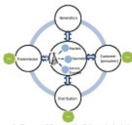
Figure 1: Concept of Smart grids. Schematic depicting the physical and communication interconnections

In 2008, I met Dr. Paulo Ribeiro, an eminent electrical engineer, at the time professor at Calvin College (Grand Rapids, USA). Dr. Ribeiro's main research topic is electrical energy infrastructure of the future. In the coming decades, our energy systems will change strongly. It is believed that large scale power plants will be complemented by a large number of small scale energy generation units; amongst others, individual households will generate solar or wind energy. It is also believed that intelligent systems will be used to more comprehensively communicate, control, protect and balance supply and demand of energy. The whole system of central and local energy generation, transmission and distribution, and enabling intelligent control and information systems is called a smart grid. Smart grids will be integrating micro grids (local systems) and super grids (high voltage transmission and bulk generation systems). Figure 1 illustrates the new concept of smart grids and the functional relationship among the different subsystems and technologies. The bulk generation, transmission, distribution and customers are directly and electrically connected and are themselves linked via communication systems with the Markets, Operations and Service Providers. The most important characteristics of smart grids are described by the European Commission (2010) and the European Electrical Grids Initiative (2010).