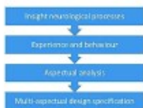
Figure 5: Application of the theory of many aspects to develop multi-aspectual design specifications