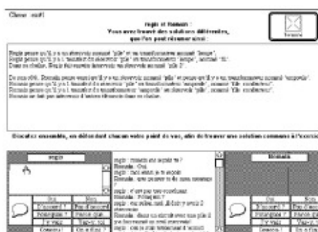
Figure 4 CMC environment shared by the subjects of the same dyad. The upper part displays the conflict situation, whereas the lower part is dedicated to communication: the two side of the dialogue history in the center subjects are provided a personal space for the introduction of communicative acts. A free text typing window can be called by clicking on the balloons. The other buttons send key messages directly to the dialogue history.

The screen used for computer-mediated argumentation is divided in two parts (see figure 4). The upper part of the screen displays the description of the conflict situation, and the instruction phrase, described in the previous section. The lower part of the screen is dedicated to communication. Two personal spaces are displayed on both sides of a central dialogue history. Subjects communicate by the use of buttons in their personal space. Some buttons send short messages to the dialogue history : 'Yes', 'No', 'I agree', 'I don't agree'... These are shortcuts because typing takes a while ; they are also provided to stimulate their use, and so to structure a certain form of discussion. Other buttons (balloon, 'Because...', see figure 4) open a pop-up text window where free text can be typed. The students send their messages by hitting the TAB key. In this case, their message is added to the bottom of the dialogue history (bottom of screen in the middle) and their text dialogue box closes. The design and implementation of the computer-mediated communication part of this interface was based on previous research carried out within GRIC-COAST (Baker & Lund 1997).