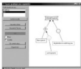
Figure 1 The Java interface for Graphical Argumentation in DREW.

Figure 1 is a screen dump of the implementation of this graphical system in a Java applet, running in the collaborative environment DREW( iv ). In this simulated example, two participants (Matthieu in blue and Bill in orange) discuss about the pros and cons of Internet. The main thesis is “Internet is good”. Participants disagree on this thesis as shown by the shape of the box. An argument against Internet is provided, denoted by the negative node: “Big Brother is watching you” (Internet is a means to control users communication and interfere with individual liberties). Both participants agree on this argument because the shape of the node is a circle. It becomes a lozenge when participants disagree. This is the case of the argument “Free speech” that supports Internet (positive node). Bill attacked this argument in its relation to the thesis: free speech is not necessary a good argument for Internet since pornographic messages could not be controlled anymore.