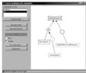
Figure 1 The Java interface for Graphical Argumentation in DREW.

Figure 1 is a screen dump of the implementation of this graphical system in a Java applet, running in the collaborative environment DREW(iv). In this simulated example, two participants (Matthieu in blue and Bill in orange) discuss about the pros and cons of Internet. The main thesis is “Internet is good”. Participants disagree on this thesis as shown by the shape of the box. An argument against Internet is provided, denoted by the negative node: “Big Brother is watching you” (Internet is a means to control users communication and interfere with individual liberties). Both participants agree on this argument because the shape of the node is a circle. It becomes a lozenge when participants disagree. This is the case of the argument “Free speech” that supports Internet (positive node). Bill attacked this argument in its relation to the thesis: free speech is not necessary a good argument for Internet since pornographic messages could not be controlled anymore.