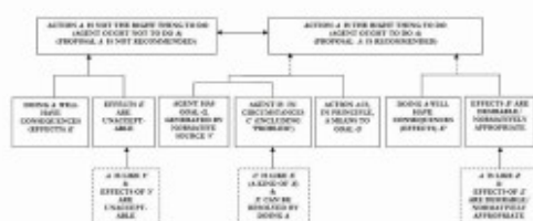
Figure 2. The relationship between the deliberation scheme and argumentation by analogy or definition

Briefly, making one element of the deliberation scheme more salient, while correspondingly de-emphasizing others, is expected to result in a shift in the decision for action that the audience will arrive at, given that the salient element is expected to override non-salient elements in the process of weighing reasons. It does not follow, of course, that the audience will be actually influenced in this way, and that they will automatically ground their decisions in the premises made salient through framing. In real-world contexts, framing effects are weakened by the public’s exposure to alternative arguments, their ability to come to their own conclusion, as well as by their pre-existing beliefs and values (Sniderman & Theriault 2005; Chong & Druckman 2007).