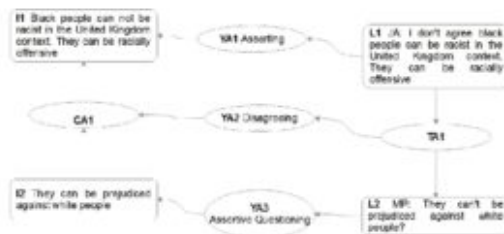
Figure 4: IAT representation of example 5

Melanie Phillips: They can't be prejudiced against white people? (AIFdb corpora: Argument Map 1520)