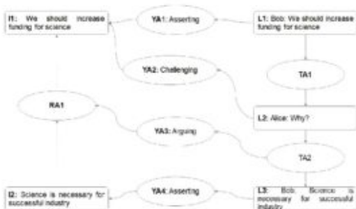
Figure 1: IAT representation of example 2

Using the IAT framework the dialogue between Bob and Alice from example 2 can be represented as in figure 1: