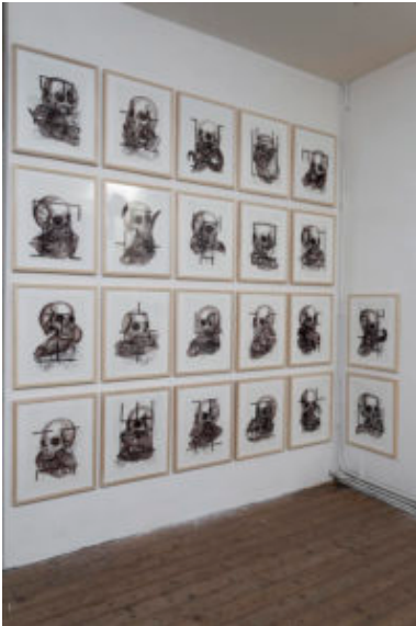
Joseph Sassoon Semah - On Friendship / (Collateral Damage) III - The Third GaLUT: Baghdad, Jerusalem, Amsterdam, 2019 22 drawings, sepia ink on paper, brown thread, glass, wood, 50x40cm