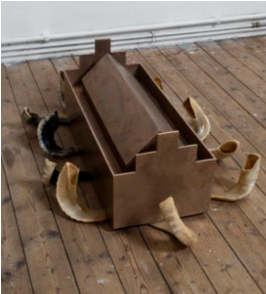
Joseph Sassoon Semah - On Friendship / (Collateral Damage) III -The Third GaLUT: Baghdad, Jerusalem, Amsterdam, 2019 (Between Graveyard and Museum's Sphere) 2019 Model based on Synagogue Meir Tweig, Baghdad, Iraq Bronze, 10 ShOFaROT, 70x30x33cm