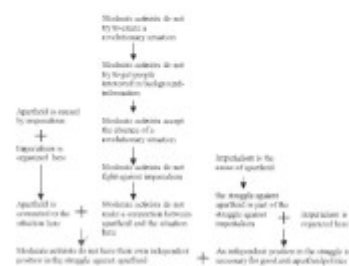
Figure 2 The Revolutionary organization

the eighties, activists from the squatter and anarchist movement got involved with this struggle as well. One of their activities consisted of assaults on Shell-filling stations. At the end of the eighties this so-called 'pump-slashing' became quite popular among radical activists in the Netherlands, Denmark, Germany and other West European countries. In Western Europe more than 120 filling stations were damaged (Buijs 1995). 'De Zwarte' was a small magazine that was made by and for radical activists.