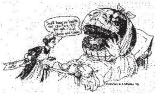
"The Spirit of Peace"

message is in part visual, it functions as a pointed comment on the causes of the war. Ingeniously, Bradley portrays the world at war as a person afflicted with a terrible tooth ache and the world's "old" monarchies as dental crowns. The nurse labelled "The Spirit of Peace" provides his own diagnosis: the war will end and the world will enjoy peace and comfort only when its old crowns are removed.