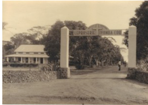
Entrance to the Iyonda leprosy, with the missionary fathers' house on the left, where Greene was accommodated. The first part of the 8mm film was recorded on the loggia of this house.

particularly proud to receive the famous author, who had not only converted to Catholicism in his early twenties but some of whose books, such as Brighton Rock , The Lawless Roads , The Power and the Glory , The Heart of the Matter , and The End of the Affair , also developed profoundly Catholic themes.