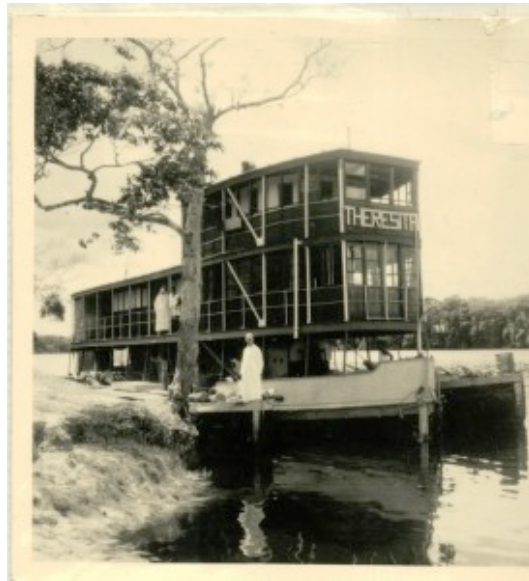
The river steamer Theresito, property of the MSC missionaries in the Congo and used by Graham Greene in 1959 to move from one mission station to another.

Congo, and the novel “is not a roman à clef , but an attempt to give dramatic expression to various types of belief, half-belief, and non-belief, in the kind of setting, removed from world-politics and household-preoccupation, where such differences are felt acutely and find expression” (Greene 1977 [1960]: 5). Yet, however much I agree that reading A Burnt-Out Case as a roman à clef would severely miss the author’s point and defeat the purpose of the artistic experience, there do seem to be closer resemblances than Greene admits.