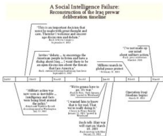
Figure 2. Iraq prewar deliberation timeline

Bearing in mind the tension between speech acts arrayed on the top portion of the timeline in Figure 2 and the speech acts falling in the bottom portion of the timeline, it becomes apparent that Bush’s (2003) statement on 6 March 2003 that “I’ve not made up our mind about military action” was a strategic maneuver, one designed to improve rhetorically his position in the unfolding public argument. The political windfall from such a statement is clear, given the political and military necessity that the decision to invade Iraq be justified on the basis of democratically sound procedures (see Payne 2006). But this returns us to the question that percolated out of the first section of this paper – how should Bush’s strategic maneuvering be classified? Was it a legitimate argumentative move, or a fallacious derailment of a critical discussion, or something else altogether? Considering each possibility in turn provides an opportunity to apply and develop the theoretical concepts regarding the role of standpoint commitment in argumentation.