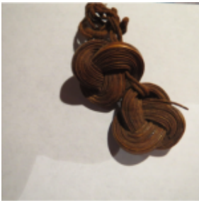
Fig. 1: Showing kata as part of a Shiinji divination basket.