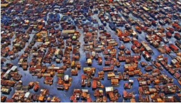
Illustration by NLE architects amusingplanet.com

Makoko used to be a small fishing village built by fishermen who came from Benin to make money more than a hundred years ago, before it grew into an illegally constructed one-square-kilometer urban settlement. The population now consists mainly of migrant workers from West African countries, trying to make a living in Nigeria. The oily black water is no longer suitable for fishing; it emits a pungent smell, and a thick layer of white scum gathers around the shack stilts.