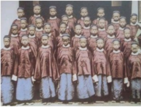
Picture 1.1 Chinese educational mission studentsChinese educational mission students sent by Qing government before they went to America in Qing dynasty .

Those students dispatched abroad were mostly male. When they reached western countries, as the first batch of Chinese to make contact with western land at that time, which entailed a totally different culture, society, set of customs and conceptualisation for male and female compared to China they experienced an unprecedented ideological shock. Chinese students abroad were attracted by the liveliness and romance of the Western female. One of the first Chinese students studying abroad to marry a Western wife was Yung Wing, who studied in the USA, and married an American woman, Miss Kellogg, of Hartford, who died in 1886. [xlix] Yung Wing probably was the first Chinese to go to study in the USA during the Qing dynasty, and he obtained a degree from Yale University. Yung Wing was born at Nanping, Xiangshan County (currently Zhuhai City) in 1828. In 1854, after Yung Wing graduated from Yale College, he came back to China with a dream that, through Western education, China might be regenerated, and become enlightened and powerful. From then on, he devoted his life to a series of reforms in China.