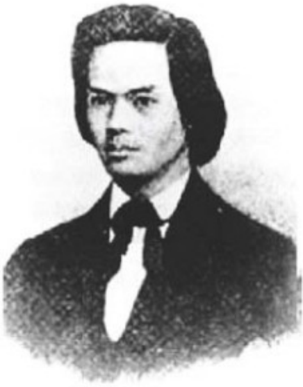
Picture 1.3 Dr. Yung Wing