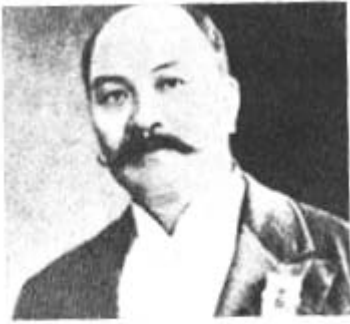
Sir Kai Ho