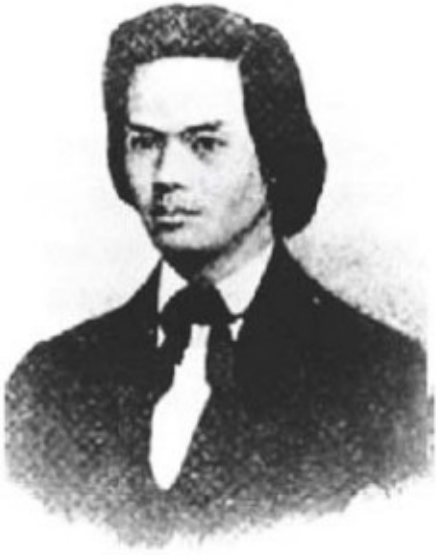
Picture 1.3 Dr. Yung Wing