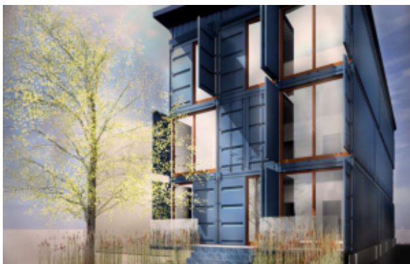
Rendering of the container condo