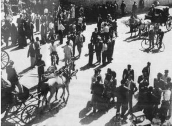
The Old Jewish Quarter of Baghdad