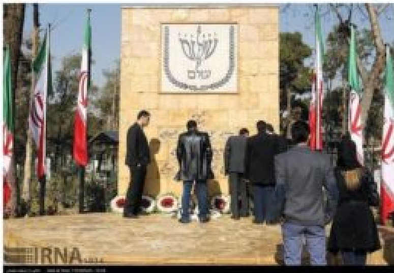
Figure 2.5. Iran's monument for the Jewish Shahids of the Iran-Iraq War. Source: Washington Post, December 18, 2014; www.washingtonpost.com . See also "Iran unveils monument to Jewish soldiers killed in war with Iraq," Haaretz and the Associated Press, December 18, 2014; www.haaretz.com .

through the years of the Iran-Iraq War, Sinan returns from the United States to a post-2003 Iraq, registering the multiple transformations in his devastated city. In one scene, Sinan visits the memorial site for the Iraqi soldiers built by Saddam Hussein's regime for the martyrs of the Iran-Iraq War. The names of numerous shahids (the martyrs) are inscribed on the walls in Arabic; but now the walls also display, in English, an American military parking sign, in complete disregard for the significance of the memorial. The oblivious U.S. soldiers have little in the way of a good explanation for the Iraqi American returnee, who is visibly upset by the sacrilege of this military action. In this way, the Iran-Iraq War memorial, a reminder of the many young Iraqis killed in a senseless war, is now an occupied American site that in itself becomes a reminder of the many afflictions Iraqis have had to endure after the Iran-Iraq War, i.e., the Gulf War, sanctions, the 2003 war—all of which resulted in countless killed, maimed, and wounded as well as the death of the elderly, babies, and the sick due to malnutrition, lack of medicine, and environmental disasters. Such superimposed devastations have continued to haunt Iraqi people long after the Iran-Iraq War. In About Baghdad , the post-2003 encounter with the Iran-Iraq War memorial site triggers the memory of a fresh war whose reality “on the ground” is documented in every scene.