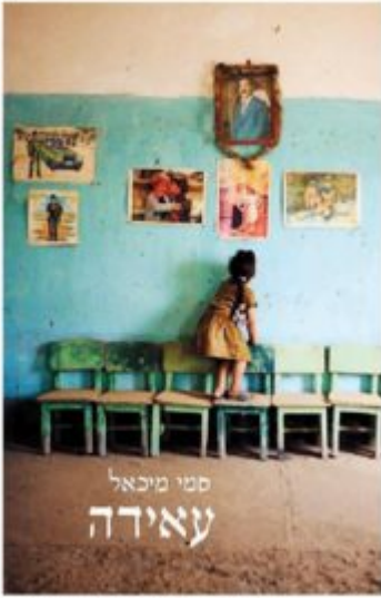
Figure 2.4. Aida's Book Cover—Reading Iraq in Hebrew