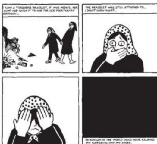
Figure 2.1. The recusatio in Persepolis . Image courtesy of Marjane Satrapi, The Complete Persepolis (Pantheon, 2007), p. 142.

Such exilic memoirs and novels are embedded in a structural paradox that reflexively evokes the author’s displacement in the wake of war. The dissonance, however, becomes accentuated when the “cover language” belongs to an “enemy country,” i.e., Israel/Hebrew, or United States/English. The untranslated Farsi or Arabic appears in the linguistic zone of English or Hebrew to relate not merely an exilic narrative, but a meta-narrative of exilic literature caught in-between warring geographies.