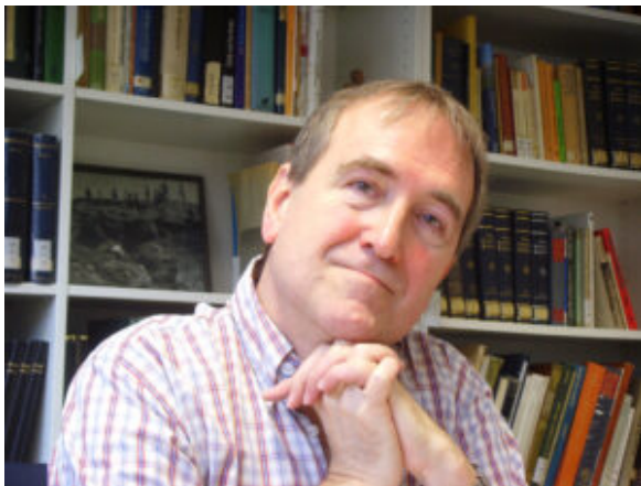
Chris Stringer

An interview with Professor Chris Stringer, one of the leading experts on human evolution.