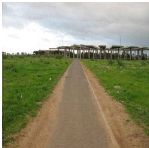
Fig.1.1.A - The field between UWC and Hector Peterson Residence

Women nevertheless feel vulnerable and in need of protection by men; female students who cross the field (see figure 1.1 A-C) to campus get a sense of safety from the presence of security staff who stand watch at an unfinished structure on the field. Since men are viewed as protectors, they stand guard, irrespective of whether they are equipped or even trained to deal with violence. If anything should happen to a student, security is supposed to release the dog to chase the perpetrator off. Yet in one instance where a student was attacked the security staff member held onto the dog - probably as a means of self-protection.