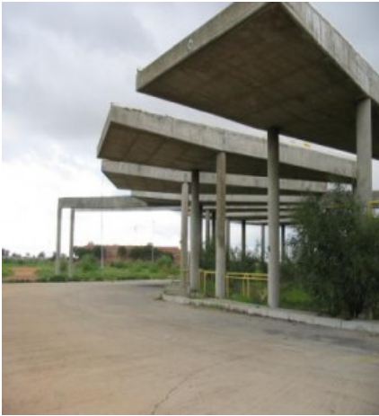
Unfinished Structure - Photo by author

Violence is everywhere (Lindiwe, Hector Peterson Residence).