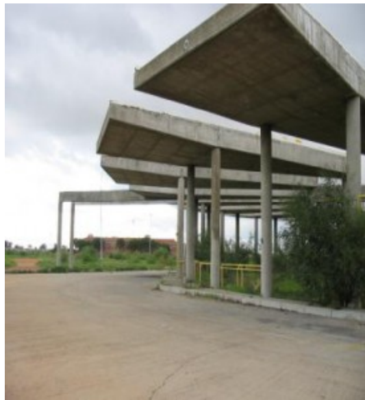
Fig.1.1.B - Unfinished structure

Students who cross the field at midnight run the risk of attack because the field is deserted. The unfinished structure seems to be a good place for muggers to hide and catch their 'prey' unguarded, which is exactly why security staff are placed there. It is also one of the places both males and females have identified as a dangerous space. It makes them feel very vulnerable and they only feel at ease once they passed it.