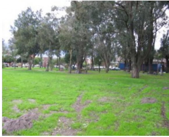
Figure 1.4 - Condom Square, which is adjacent to The Barn. According to rumours, a woman student was raped here

To the stranger's eye, The Barn and Condom Square may look like places of relaxation which offer extra-mural activities to students. On weekends one might get a different picture due to the rowdiness, the loud music, the smell of alcohol and marijuana and the poor lighting at night, all coming from the direction of those two places. As a result of this, students feel unsafe, especially when fights break out. Catherine's fear that if something happens to her nobody will hear, makes her feel unsafe whenever she passes by en route to campus. The sight of a pair of panties and condoms gave her the feeling that forced sex had happened and that she might be in danger. A reported instance of attempted rape also took place on Condom Square when a number of men jumped from the trees and tried to rape a woman student. She managed to free herself. Stories about Condom Square, although not corresponding with what Campus Protection Services report, may also make students feel unsafe. Avoiding such a space is a safety tactic.