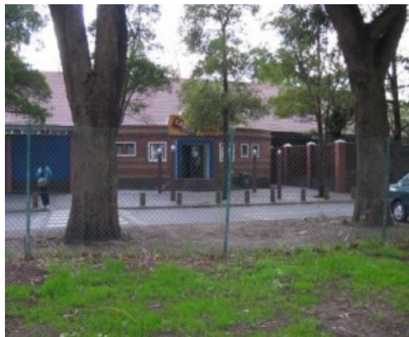
Fig.1.3 - The Barn, where students go for drinks and to dance. Fights are known to occur outside after people vacate The Barn