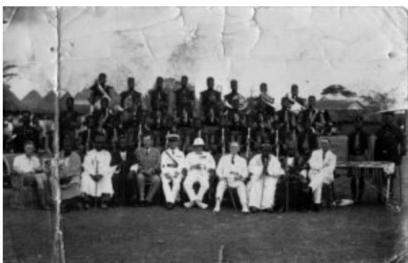
Seated company and military chapel