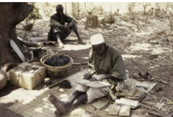
Pounding rice, Guinea-Bissau