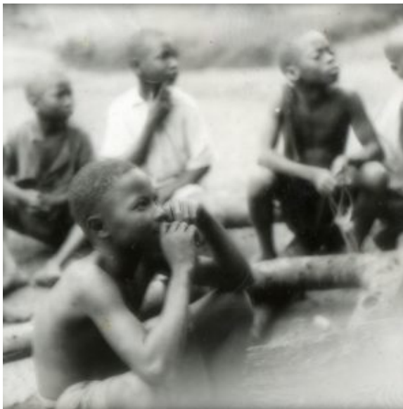
Four boys looking/listening. Sierra Leone, 1935. Collection Hofstra. Panguma (surroundings).