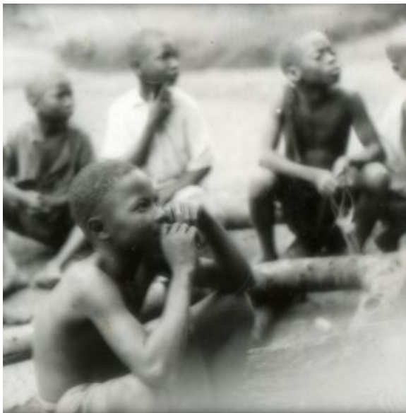
Four boys looking/listening. Sierra Leone, 1935. Collection Hofstra. Panguma (surroundings).