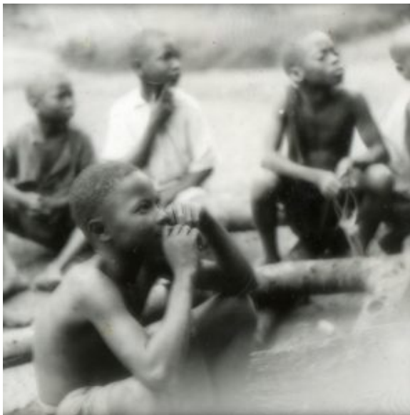
Four boys looking/listening. Sierra Leone, 1935. Collection Hofstra. Panguma (surroundings).