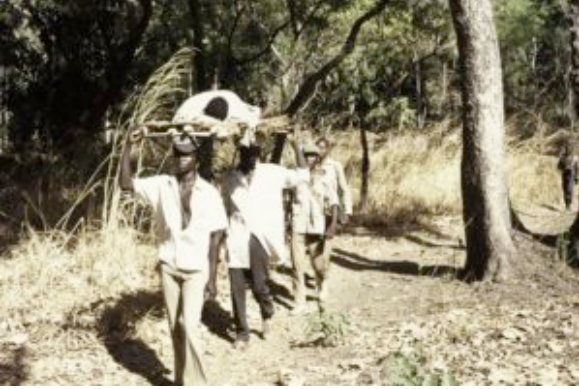
Armed escort carries the wounded to the Senegalese border