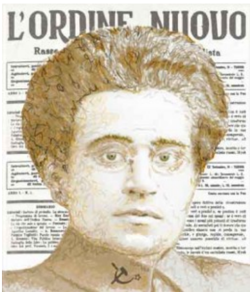
Antonio Gramsci 1891-1937