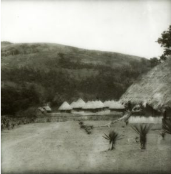
Panguma. Sierra Leone, 1935. Panguma (surroundings).