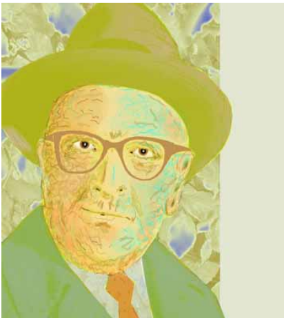
Max Horkheimer

It is about eight weeks after ending a study visit in Amsterdam with its inspiring atmosphere of a city of apparent diversity and liberty, tied into a well preserved ..., no: tied into a well carried on tradition. Few weeks after receiving the confirmation for a visiting scholarship for next year: far abroad; and about two weeks after having received a (though very) tentative invitation for a fellowship at 四川大學 some time later. And as well only a couple of days after being confronted with some issues that seem to be so far from such apparent globality - just private stuff in small village, West of Cork though not yet in the West of Ireland. Unconnected and still all belonging together in a small life, merging like the different tiny strings that make what appears to be a Gordian not.