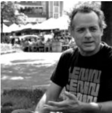
Vijay Prashad

In mid-April, the Japanese Ministry of Foreign Affairs released its Diplomatic Bluebook 2023 , its most important guidebook on international affairs. Japan's foreign minister, Yoshimasa Hayashi, wrote the foreword, which begins: "The world is now at a turning point in history." This phrase is key to understanding the Japanese approach to the war in Ukraine. Hours after Russian forces entered Ukraine, the Japanese government signed the G7 statement that condemned the "large-scale military aggression" and called for "severe and coordinated economic and financial sanctions." The next day, Hayashi announced that Japan would sanction "designated individuals related to Russia," freeze assets of three Russian banks, and sanction exports to Russia's military. In its Diplomatic Bluebook 2022 , Japan condemned Russia and urged the Russian government to "withdraw its troops immediately, and comply with international law." Russia's war, the Japanese argued, "shakes the very foundation of the international order," an order whose attrition, as the new Bluebook argues, has brought the world to this "turning point."