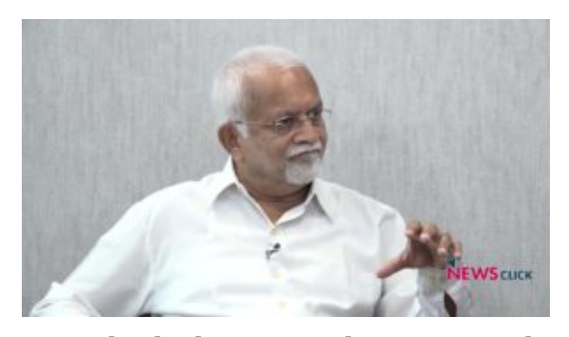
M.K. Bhadrakumar

The European Union has returned to the ritual of sanctioning Iran to leverage its foreign and security policies. The highlight of the EU Foreign Affairs Council ministerial meeting in Brussels on Monday was the imposition of sanctions against Iran over a range of issues.