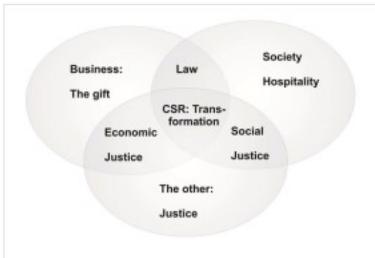
Figure 4: Deconstruction in CSR