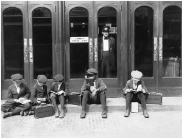
Photo: The old main library.

The aim of this essay [i] is to investigate and evaluate the ideas transcendental to the notion of 'academic capitalism in the new economy'. Ideas that will get attention are firstly structure and direction, which broadly indicate the nature that the analysis and evaluation of 'academic capitalism in the new economy' will take. A second and narrower focus on 'academic capitalism in the new economy' is to label this phenomenon as an idea-framework that moulds the universities of our times. A third distinction is to identify in the core of this framework the constitutive goods that particularly give structure and direction to the idea of the university. In the case of 'academic capitalism in the new economy', the concepts of 'profit' and 'economic growth' are identified as constitutive goods. It will be argued that this idea-anatomy prepares the arena for the deformation that sets in when the constitutive good of an entity like a university is not internal to that entity but instead a totalitarian constitutive good is imposed from outside.