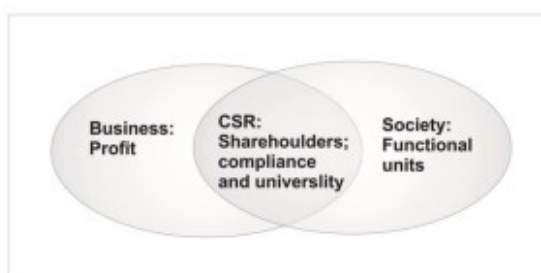
Figure 2. CSR as compliance to the law

However, according to De George (2008:82), the "task of CSR is a different task, namely influencing those in business to act in a way that is more positive in its effects on human beings, on the environment, on the common good than is often the case ....". The aim of CSR is "tampering the destructive and rapacious tendencies of unregulated big business, and has had some success in curtailing some practices harmful to people. To the extent that if it has had any success in improving the lot of human beings, CSR is a positive force in the business arena, even if poorly understood by its practitioners, even if rife with irresolvable conflicts, and even if it is in the process of deconstructing itself" (De George 2008:83). Therefore, the challenge that CSR must be open to the other makes little sense because businesses are "... engaged in production and exchange. For profit organizations are by definition self-interested entities. They are not formed to give away what they produce as gifts. They do not open themselves up hospitably and risk being taken advantage of by anyone who chooses to do so" (De George 2008:84). According to De George, the other is the antagonist of business and CSR. Business has a commercial function in society and therefore the other only interferes with this function.