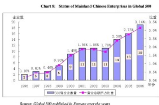
Chart 8: Status of Mainland Chinese Enterprises in Global 500

China pursues an all-dimensional reform. By combining “absorbing foreign investment” and “going international” of Chinese enterprises, China intends to let foreign investment and multinationals play an active role in the national economic and social development on the one hand, and enhance the competitiveness of Chinese enterprises in the international arena through market expansion and mutually-beneficial competition on the other.