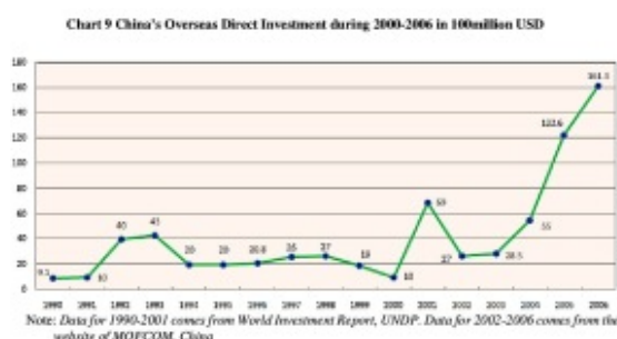
Chart 9 China's Overseas Direct Investment during 2000-2006 in 100million USD

Second, relevant government agencies have actively promoted trade facilitation by establishing and improving trade promotion services. This has offered policy