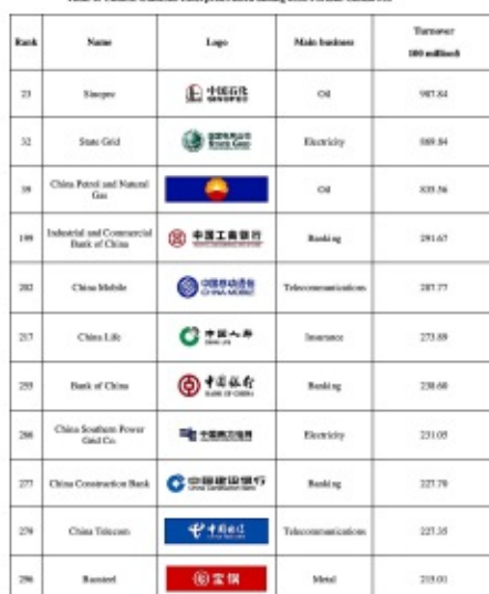
Table 2: Chinese Domestic Enterprises listed among 2006 Fortune Global 500

However, there is still a big gap between Top 500 in China and Top 500 in the US and Global 500[v] in the following aspects: