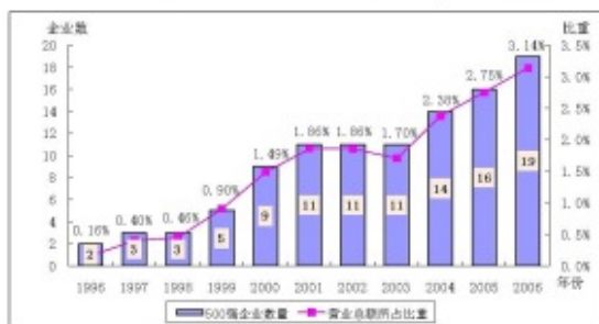
Chart 8: Status of Mainland Chinese Enterprises in Global 500