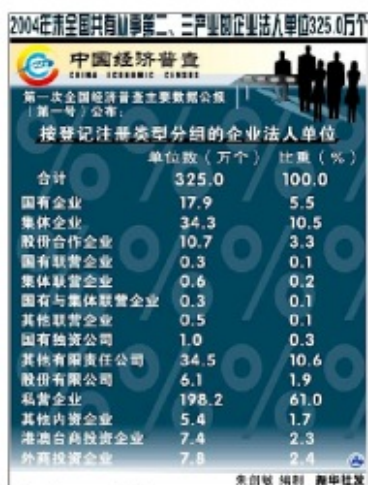
Chart 7 The Composition of China's Legal-person Entities