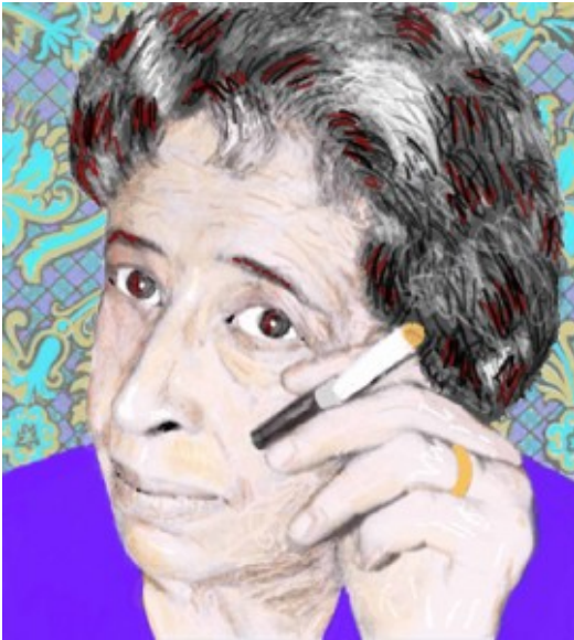
Hannah Arendt

Hannah Arendt wrote The Origins of Totalitarianism in 1949, by which time the world had been confronted with evidence of the Nazi apparatus of terror and destruction. The revelations of the atrocities were met with a high degree of incredulous probing despite a considerable body of evidence and a vast caché of recorded images. The individual capacity for comprehension was overwhelmed, and the nature and extent of these programmes added to the surreal nature of the revelations. In the case of the dedicated death camps of the so-called Aktion Reinhard , comparatively sparse documentation and very low survival rates obscured their significance in the immediate post-war years. The remaining death camps, Majdanek and Auschwitz, were both captured virtually intact. They were thus widely reported, whereas public knowledge of Auschwitz was already widespread in Germany and the Allied countries during the war. [i] In the case of Auschwitz, the evidence was lodged in still largely intact and meticulous archives. Nonetheless it had the effect of throwing into relief the machinery of destruction rather than its anonymous victims, for the extermination system had not only eliminated human biological life but had also systematically expunged cumulative life histories and any trace of prior existence whatsoever, ending with the