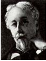
Joseph Arthur de Gobineau

since it resonated with the latter's preoccupation with the 'self' and the romantic yearning to impart 'inner experiences' with universal 'historical significance' (ibid.: 175).