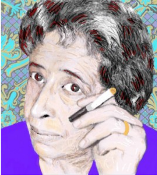
Hannah Arendt

Hannah Arendt wrote The Origins of Totalitarianism in 1949, by which time the world had been confronted with evidence of the Nazi apparatus of terror and destruction. The revelations of the atrocities were met with a high degree of incredulous probing despite a considerable body of evidence and a vast caché of recorded images. The individual capacity for comprehension was overwhelmed, and the nature and extent of these programmes added to the surreal nature of the revelations. In the case of the dedicated death camps of the so-called Aktion Reinhard , comparatively sparse documentation and very low survival rates obscured their significance in the immediate post-war years. The remaining death camps, Majdanek and Auschwitz, were both captured virtually intact. They were thus widely reported, whereas public knowledge of Auschwitz was already widespread in Germany and the Allied countries during the war. [i] In the case of Auschwitz, the evidence was lodged in still largely intact and meticulous archives. Nonetheless it had the effect of throwing into relief the machinery of destruction rather than its anonymous victims, for the extermination system had not only eliminated human biological life but had also systematically expunged cumulative life histories and any trace of prior existence whatsoever, ending with the