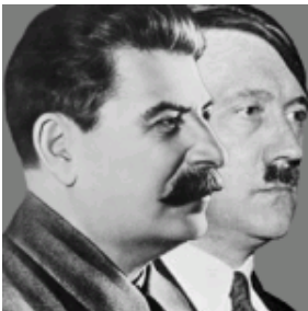
Stalin - Hitler