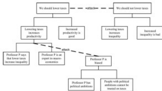
Figure 1: an argumentation framework

question whether the expert is biased (this paper's account of argument schemes is essentially based on Walton 1996). A second counterargument is stated at once in O10, attacking the conclusion of the initial argument. Both arguments are also displayed in Figure 1.