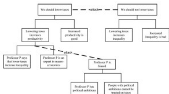
Figure 1: an argumentation framework

question whether the expert is biased (this paper's account of argument schemes is essentially based on Walton 1996). A second counterargument is stated at once in O10, attacking the conclusion of the initial argument. Both arguments are also displayed in Figure 1.