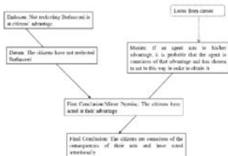
Fig. 3: Argumentative reconstruction exploiting a locus from causes