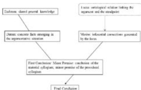
Fig. 1: The Argumentum Model of Topics.

necessarily) made explicit. In order to generate relevant arguments, as represented in the schema in fig. 1, procedural and material components must be combined in a double syllogistic structure (Fig.1):