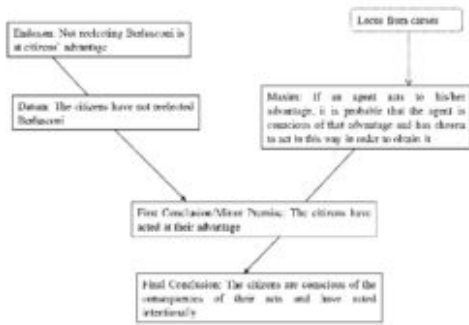
Fig. 3: Argumentative reconstruction exploiting a locus from causes