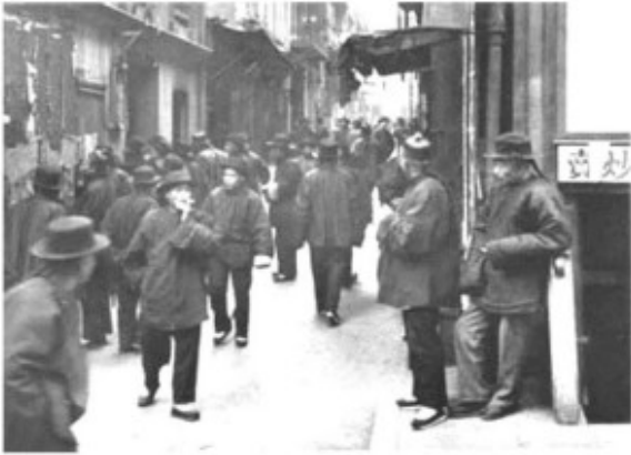
Picture 1.10 Chinatown in America of 19th Century

were about 5000 Chinese businessmen in San Francisco. [cli] Among them many achieved great success in their business, surprising the Westerners around them and changing their perception of them. [clii] In Australia, many Chinese men also came to settle there for business reasons (See picture 4.11). These Chinese stayed there because of their businesses, and some of them married local people.