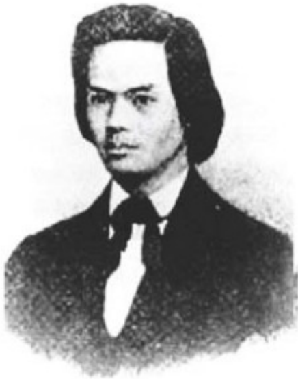
Picture 1.3 Dr. Yung Wing