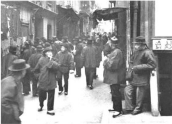
Picture 1.10 Chinatown in America of 19th Century

were about 5000 Chinese businessmen in San Francisco. [cli] Among them many achieved great success in their business, surprising the Westerners around them and changing their perception of them. [clii] In Australia, many Chinese men also came to settle there for business reasons (See picture 4.11). These Chinese stayed there because of their businesses, and some of them married local people.