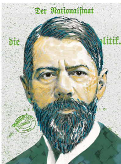
Max Weber - Illustration by Ingrid Bouws

... the world we participate in - a democratic world of democratic states and a world that looks for furthering its own claims: Participatory Democracy seems to be an answer not simply on increasing democratic demands. Rather, the other side is surely the fact that any reasonable politician, but definitely every political official "needs a people". Imagine governing just as a job - not the HELLO-position of glamour but the position of working as "service provider". Sure, many are well paid for it; and not less sure in many cases not at all exciting: study of documents, flipping through the 10th draft of something, hastening to a meeting, trying to make decisions but also trying to influence decisions by others. Taking part in cabinet meetings, delivering something for decision-making.