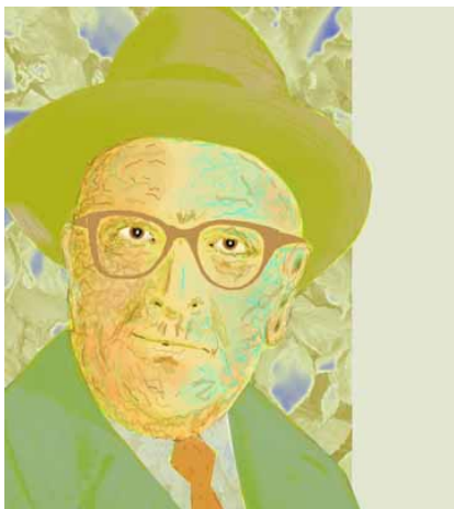
Max Horkheimer

It is about eight weeks after ending a study visit in Amsterdam with its inspiring atmosphere of a city of apparent diversity and liberty, tied into a well preserved ..., no: tied into a well carried on tradition. Few weeks after receiving the confirmation for a visiting scholarship for next year: far abroad; and about two weeks after having received a (though very) tentative invitation for a fellowship at 四川大學 some time later. And as well only a couple of days after being confronted with some issues that seem to be so far from such apparent globality - just private stuff in small village, West of Cork though not yet in the West of Ireland. Unconnected and still all belonging together in a small life, merging like the different tiny strings that make what appears to be a Gordian not.