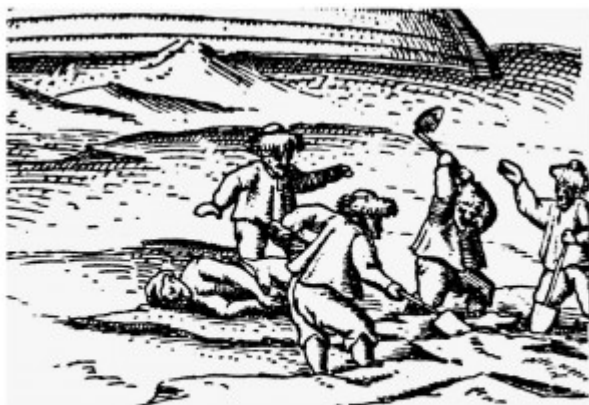
The "Plate of a cruel bear" of 12 February 1597 has a detail in the German edition that does not appear on the original plate in the Dutch edition: the burial of the "sicke".

The 13 June [1597] it was fair weather. The master and the carpenters went to the ship and prepared the boat and the sloop. The master and those that were with him, seeing that there was open water and a good west wind, came back to the house and he said to Willem Barents (who had long been sick) that it was a good time to leave. They resolved jointly with the ship's company to take the boat and the sloop to the waterside and in the name of God