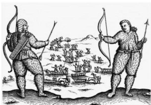
Samoyeds and their kingdom (Hulsius #10), with firearms demonstration in background.

Their apparition is like we used to paint wild men; but they are not wild, because they are of reasonable judgement. They dress in deer skins from head to feet, unless it be the chief among them, which, man or woman, are dressed like the others, as said, except for their heads, which they cover with a colored cloth lined with fur. The others wear caps of deerskin, with the rough side out, which close around their heads. They have long hair, which they braid with a long tail on their backs. They are (most of them) short and of low stature, with broad flat faces, small eyes, short legs, their knees standing outward, and they are very quick [...] Their sledges stood always ready with one or two deer, which run so swiftly with one or two men in them that our horses would not be able to follow them. One of our men shot a musket towards the sea, wherewith they were in such great fear that they ran and leapt like mad