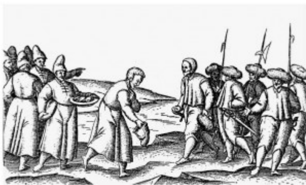
28 July 1597: "Plate of how we after a long and sad journey encountered two Russian lodyas." Van Heemskerck is recognizable up front on the right, fox-fur hat in left hand.

[20 August 1597] Then we went on land [on the western shore of the White Sea] into the houses that stood upon the shore, where they showed us great friendship. They led us into their rooms and bade us to sit down and cooked us a dish of fish, and made us right welcome. [...] They lived very poorly and ordinarily eat nothing but fish. During the evening, when we prepared ourselves to go back to the sloop,