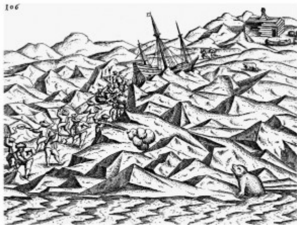
12 June 1597: "Plate of how we with great effort leveled a way across the ice." Although the plates by De Bry in the German ( Hulsias ) edition are less artistic than the Dutch edition plates, they are more informative. Plate #27, shown here, includes the Saved House as it was left behind: partly torn down.

snow, but we were comfortable knowing that the sun was on its way to us again, for (we calculated) that day it had reached the Tropic of Capricorn, which is the utmost limit it reaches before returning north. This Tropicus Capricorni lies south of the equinoctial line at 23 degrees and 18 minutes.