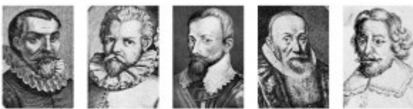
a. Willem Barents; b. Jan Huyghen van Linschoten; c. Jacob Heemskerck; d. Petrus Plancius; e. Jan Cornelisz Rijp

This strengthened my opinion that the sea east of the strait is a continuing sea. Several men went ashore and discovered a whale stripped by the Samoyedes. The cheekbones measured 16 feet. They brought five for display as oddity in our country. One may see them in the Doelen in Enkhuizen and another one in the city hall of Haarlem; I presented them to these cities for eternal memory, and love for patria.