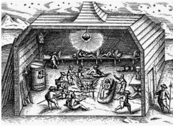
The interior of the Sved House, as depicted in the German edition of the "True and Perfect Description" (Hulsius 1598). This plate accurately depicts the lamp that burned day and night (27 October 1596; 12–13 February 1597), the wine barrel turned into a steam bath (4 November 1596), the hunk, kettle (Fig. 7.8), and clock (Fig. 7.9). When the clock froze, the passing of time was recorded with an hourglass.

On the 12 [October 1595] we saw the sun and could finally measure an afternoon height. Our latitude appeared to be 73^{\circ}20' and we estimated to be off the coast of Tromsø. This is the same latitude as Vaygach, Kanin, or Svyatoi-Nos, but here it wasn't as cold as it was there, even though it was later in the season. This is remarkable but one may explain it from the large amounts of sea ice near Vaygach, which probably severely cool the air. It remains an open question why in these