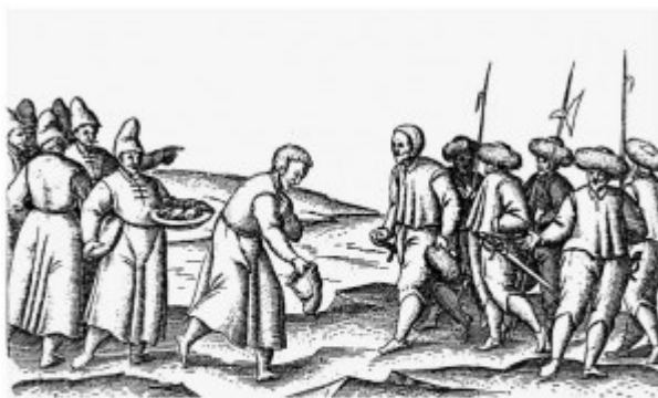
28 July 1597: "Plate of how we after a long and sad journey encountered two Russian lodyas." Van Heemskerck is recognizable up front on the right, fox-fur hat in left hand.

[20 August 1597] Then we went on land [on the western shore of the White Sea] into the houses that stood upon the shore, where they showed us great friendship. They led us into their rooms and bade us to sit down and cooked us a dish of fish, and made us right welcome. [...] They lived very poorly and ordinarily eat nothing but fish. During the evening, when we prepared ourselves to go back to the sloop,