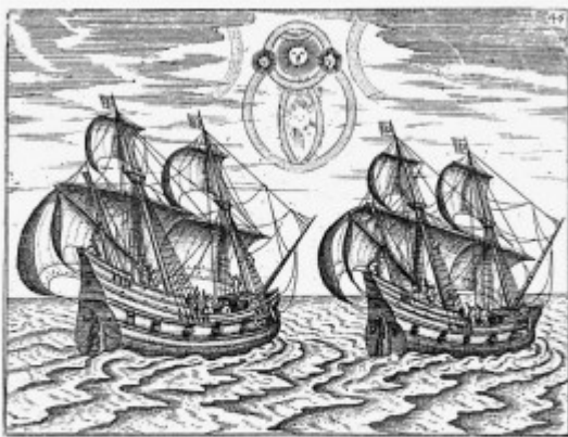
4 June 1596: "Plate of a miraculous heaven" depicts the phenomenon of sun dogs, caused by ice crystals high in the atmosphere.

It is a most certain and assured assertion, that nothing doth more benefit and further the common-wealth (specially in these countries) than the art and knowledge of navigation, in regard that such countries and nations are mighty and strong at sea, have the means and ways to draw, fetch, and bring the principal commodities and fruits of the earth [...], and carry and convey to the same places such wares and merchandise whereof they have great store and abundance [...]. There are continually more voyages made and strange coasts discovered; perhaps not in a first, second, or third journey but [only in full extent] by continuance of time reaped. [...] As long as the results are useful, there is no more meaningful exertion than toil in the common good and benefit of all