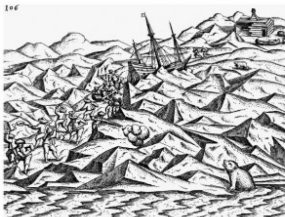
12 June 1597: "Plate of how we with great effort leveled a way across the ice." Although the plates by De Bry in the German (Hulsius) edition are less artistic than the Doetecoven plates, they are more informative. Plate #27, shown here, includes the Saved House as it was left behind: partly torn down.

snow, but we were comfortable knowing that the sun was on its way to us again, for (we calculated) that day it had reached the Tropic of Capricorn, which is the utmost limit it reaches before returning north. This Tropicus Capricorni lies south of the equinoctial line at 23 degrees and 18 minutes.