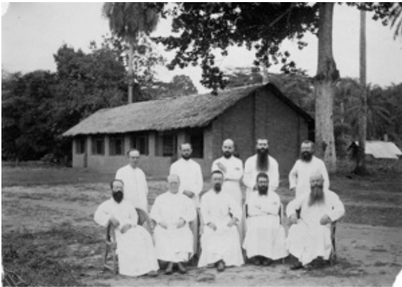
Brothers of the Christian Schools, Bamanian 1929.

according to their own chronicler, there were supposed to be 65 different schools of the Brothers existing in the Congo, with over 18 000 pupils in total. About a third of these were in Leopoldville, illustrating the fact that the Brothers clearly concentrated their activities in the centres and towns.[xlvi] Their presence in the region of the MSC was restricted to Bamanian (from 1926) and Coquilhatville ( cité indigène , from 1929-1930).