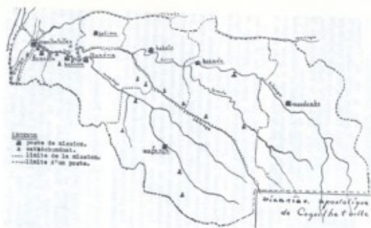
Image 4 - Map of the mission region of the MSC, 1975. From MSC-circle anniversary number 1975, 50 years MSC in Congo/Zaire.

expanded in the course of the years to fifteen or so for the whole vicariate. Boende, Mondombe (both 1925) and Flandria (1926) date from the very early years of the Sacred Heart mission. Later, Imbonga (1940) was added. In the post-war period a third parish was founded in Coquilhatville (Coq II, 1956) and a second in Boende (1956) as well as new posts in Iyonda (1945) and Nkembe (1953). The positions of the different mission posts can clearly be seen on the overview map of the Equatorial district reproduced here.[xxxviii]