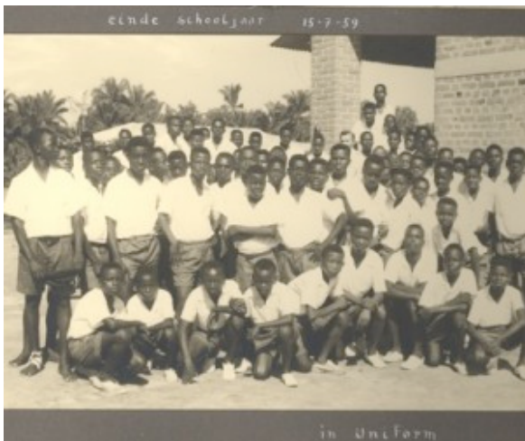
Class photo of the highest class of the boys' school in Bokuma, 1959.