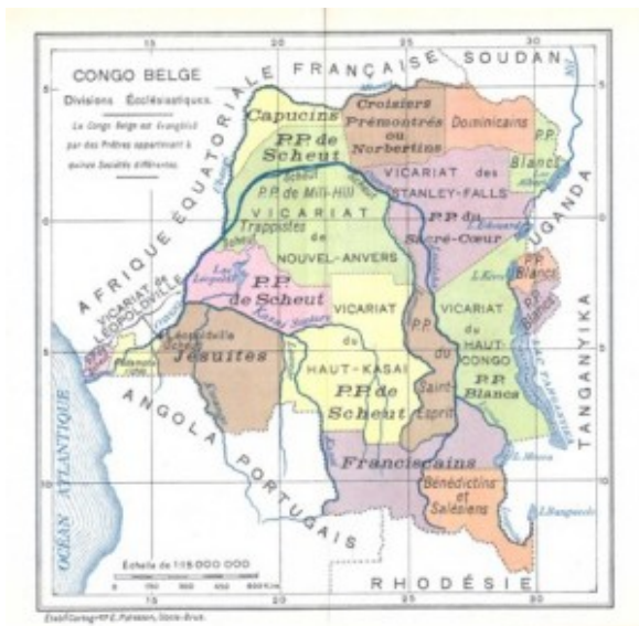
Figure 1 - Canon law organisation in the Belgian Congo. From Corman, Annuaire des missions catholiques , 1924.

action plan for systematic subsidisation of the Catholic missions' education.[xxxii]