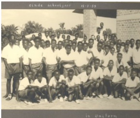
Class photo of the highest class of the boys' school in Bokuma, 1959.