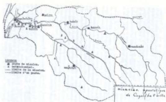
Image 4 - Map of the mission region of the MSC, 1975. From MSC-circle anniversary number 1975, 50 years MSC in Congo/Zaire.

expanded in the course of the years to fifteen or so for the whole vicariate. Boende, Mondombe (both 1925) and Flandria (1926) date from the very early years of the Sacred Heart mission. Later, Imbonga (1940) was added. In the post-war period a third parish was founded in Coquilhatville (Coq II, 1956) and a second in Boende (1956) as well as new posts in Iyonda (1945) and Nkembe (1953). The positions of the different mission posts can clearly be seen on the overview map of the Equatorial district reproduced here.[xxxviii]