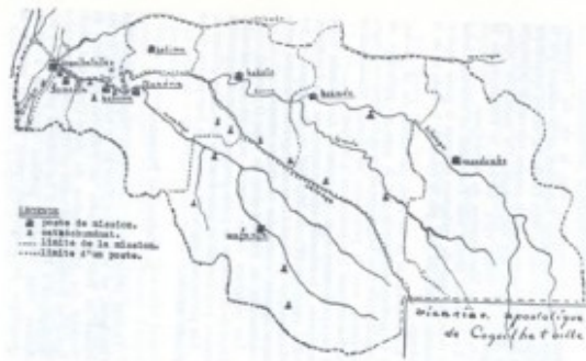
Image 4 - Map of the mission region of the MSC, 1975. From MSC-circle anniversary number 1975, 50 years MSC in Congo/Zaire.

expanded in the course of the years to fifteen or so for the whole vicariate. Boende, Mondombe (both 1925) and Flandria (1926) date from the very early years of the Sacred Heart mission. Later, Imbonga (1940) was added. In the post-war period a third parish was founded in Coquilhatville (Coq II, 1956) and a second in Boende (1956) as well as new posts in Iyonda (1945) and Nkembe (1953). The positions of the different mission posts can clearly be seen on the overview map of the Equatorial district reproduced here.[xxxviii]