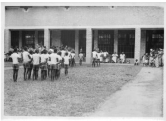
Prize-giving in Boteke (Flandria), in the 1950s.

reports from the first half of the fifties were mainly restricted to the building of a new school for the Batswa. Flandria therefore had three schools: a school on the H.C.B. ground, one at the mission post (situated next door), and the so-called Batswa school. From what appeared in the Annals it can be deduced that this was the same boys' school.[cxlvii] A notable observation about the rural schools: the report from 1955 gives 21 rural schools with about 1 300 children in the interior. This differs greatly from the numbers from 1949. Probably the intention of the Apostolic Vicar to reduce the number of rural schools was in fact being carried out, although I have not yet found any convincing evidence of this.[cxlviii]