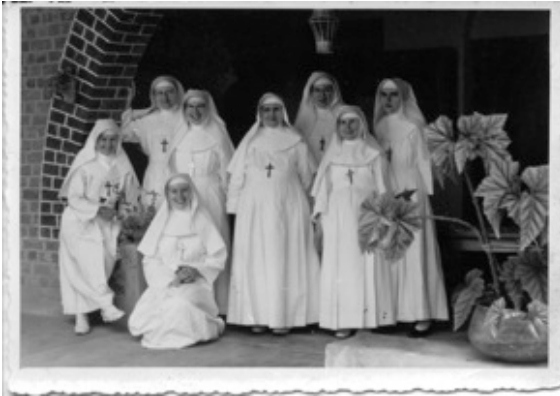
Group photo of Sisters of Beveren-Waas, in Bolima, date unknown.

To give a more coherent picture of the development of education in the region studied, it is necessary to start with a brief explanation of the development of the church hierarchy in the region and the way in which this was concretized by the religious orders that would become responsible for education. This subject will be covered in this chapter in two parts. The first part handles the evolution of the church hierarchy in a strict sense and the delineation of what would eventually become the mission area of the MSC. The presence and missionary work of the Trappists in the area will be discussed first. Chronologically, this history only begins once this congregation had decided to leave the Congo, but it is useful to consider a number of events from the preceding period in order to understand the activities of the MSC properly. The identity and presence of the other religious orders in the mission region and their involvement in education will then be outlined. Finally, the second part will describe a quantitative development of the schools in the vicariate on the basis of a number of statistical data. This will enable us to give the direct context of the reality in the classroom that will be considered in more detail in the second part.