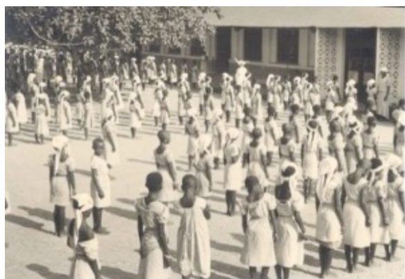
Playground of the girls' school Sainte Thérèse in Coquilhatville, in the fifties.

neighbourhood for the indigenous people was officially called.