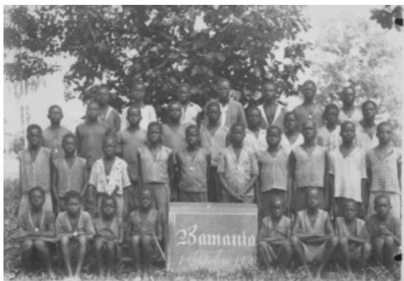
Group photo of pupils in Bamanya, 1930.