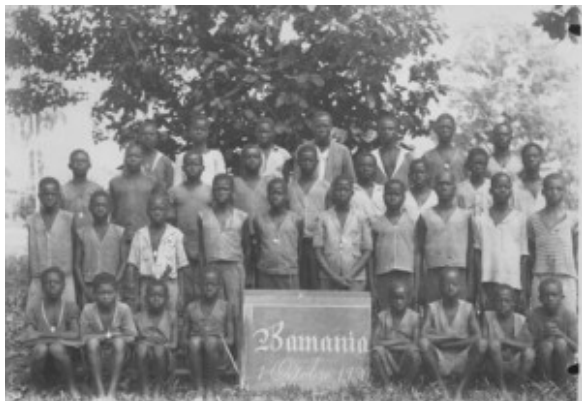
Group photo of pupils in Bamanya, 1930.

In the previous chapters, what was actually happening during lessons became dimly visible here and there. In this chapter this will be examined more closely. Learning in a class situation can be approached in many different ways. I assume in any case that a combination of various points of view is needed to achieve a picture of 'reality'. What was taught? This can be deduced from the content of curricula tested by the commentary in inspection reports. It can also be partially deduced from the subject matter in the textbooks used. How was this taught? This is actually a question of the pedagogical principles the missionaries adhered to: did they talk about this? Did these principles even exist?